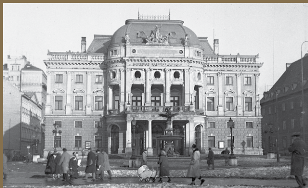
The theatre's Historical Building, 1960