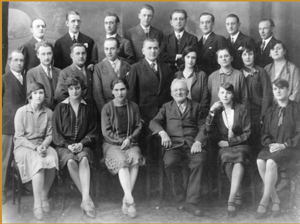
The theatre's drama company, 1925